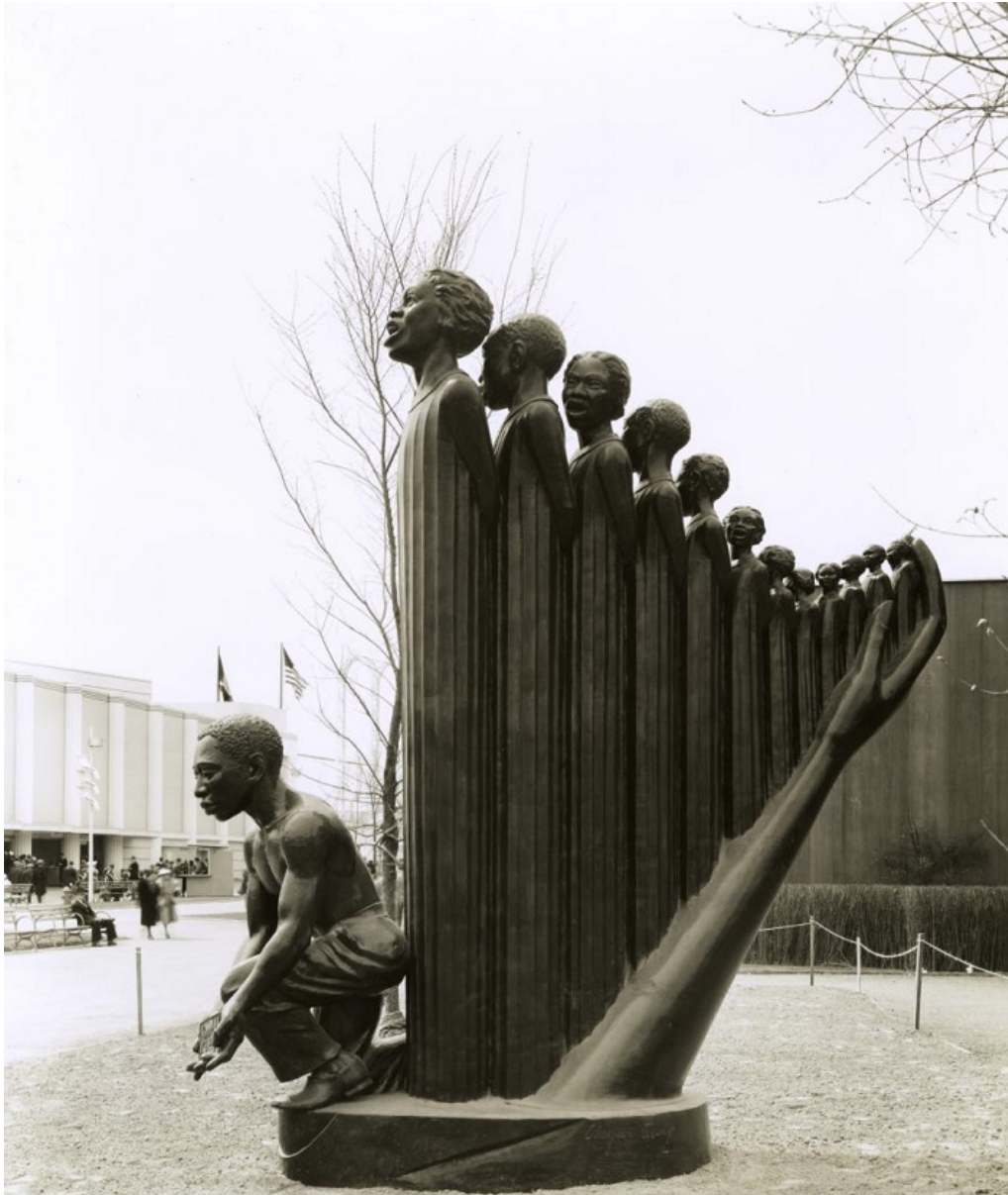
The Harp by Augusta Savage, displayed at the 1939 World's Fair in New York City

3031 Monticello Blvd, Cleveland Heights OH 44118