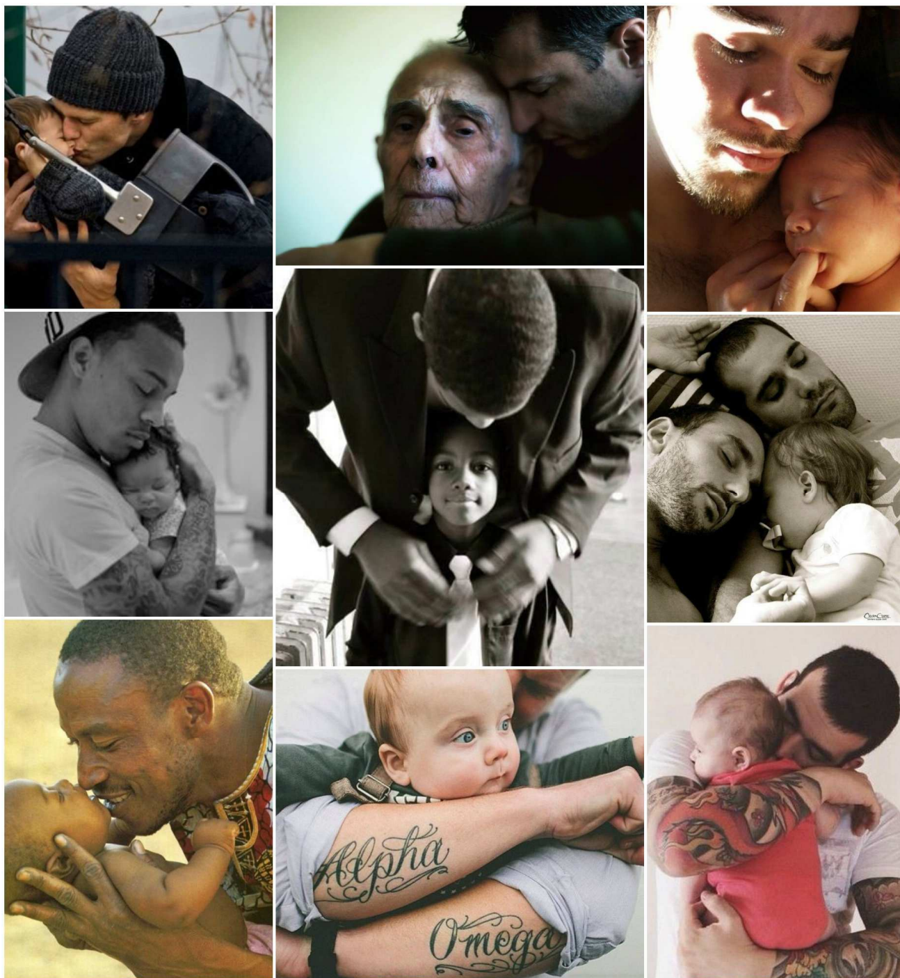
Collage of fathers and sons by various artists