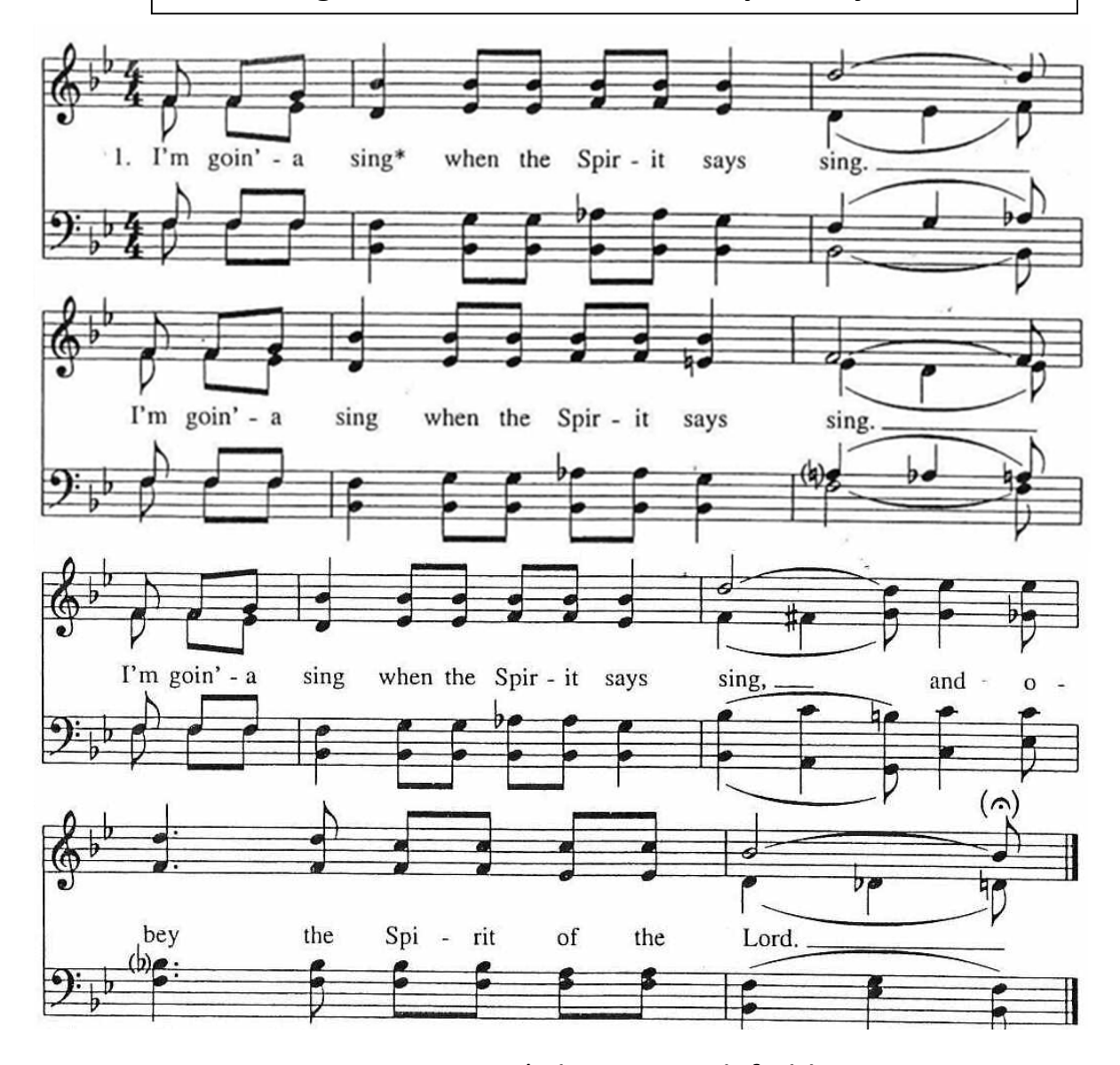
*please stand if able

St 4: I'm goin' -a SHOUT when the Spirit says SHOUT