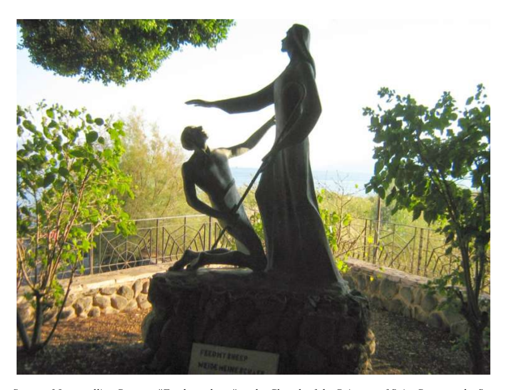
Statue of Jesus telling Peter to "Feed my sheep" at the Church of the Primacy of Saint Peter on the Sea of Galilee in Tabgha, Israel. Traditional site where Jesus Christ appeared to his disciples after his resurrection.

3031 Monticello Blvd, Cleveland Hts OH 44118 216-321-2660 Fax: 216-320-1214