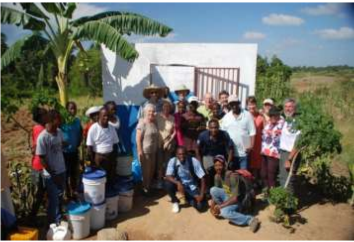
FHC Haiti Team with leaders and residents of Gabo at the water well paid for by members and friends of FHC