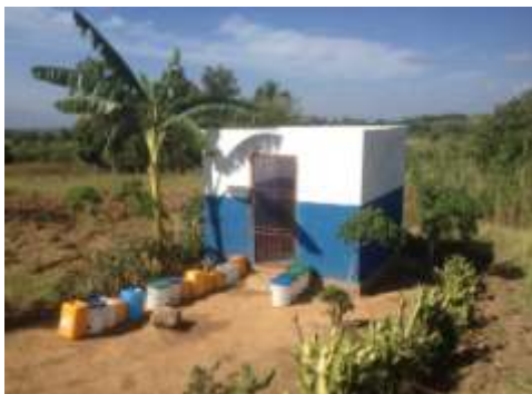
The completed well house, with buckets ready to draw water