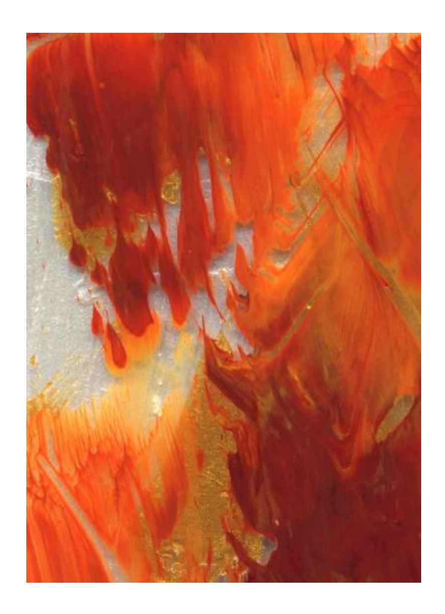
Discovering God's call, celebrating the Spirit's presence, Witnessing to Christ's transformative power!

Email: office@fhcpresb.org Website: www.fhcpresb.org